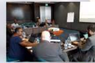
APAC annual meetings Kenya, April 2019