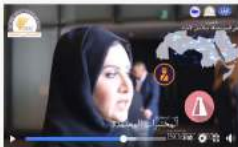
Chair speech for WAD 2019 116,298 People Reached