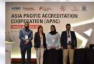
APAC annual meetings Singapore, June 2019

ARAC Chair, executive members and full members participated to regional meetings of other Regions for cooperation and joint activities.