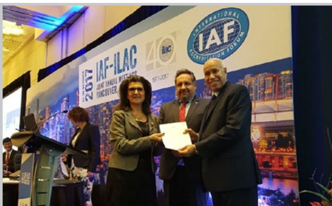
Signing Ceremony ARAC ILAC and IAF (Vancouver, Canada, ILAC IAF General Assembly 2017)

Following this decision, the regional accreditation cooperation ARAC MLA became internationally recognized in the following accreditation scopes: